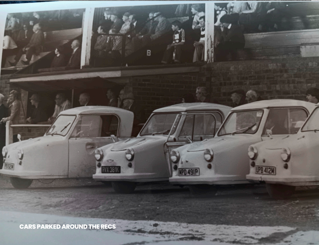
CARS PARKED AROUND THE RECS