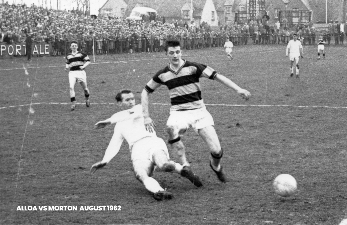
ALLOA VS MORTON AUGUST 1962